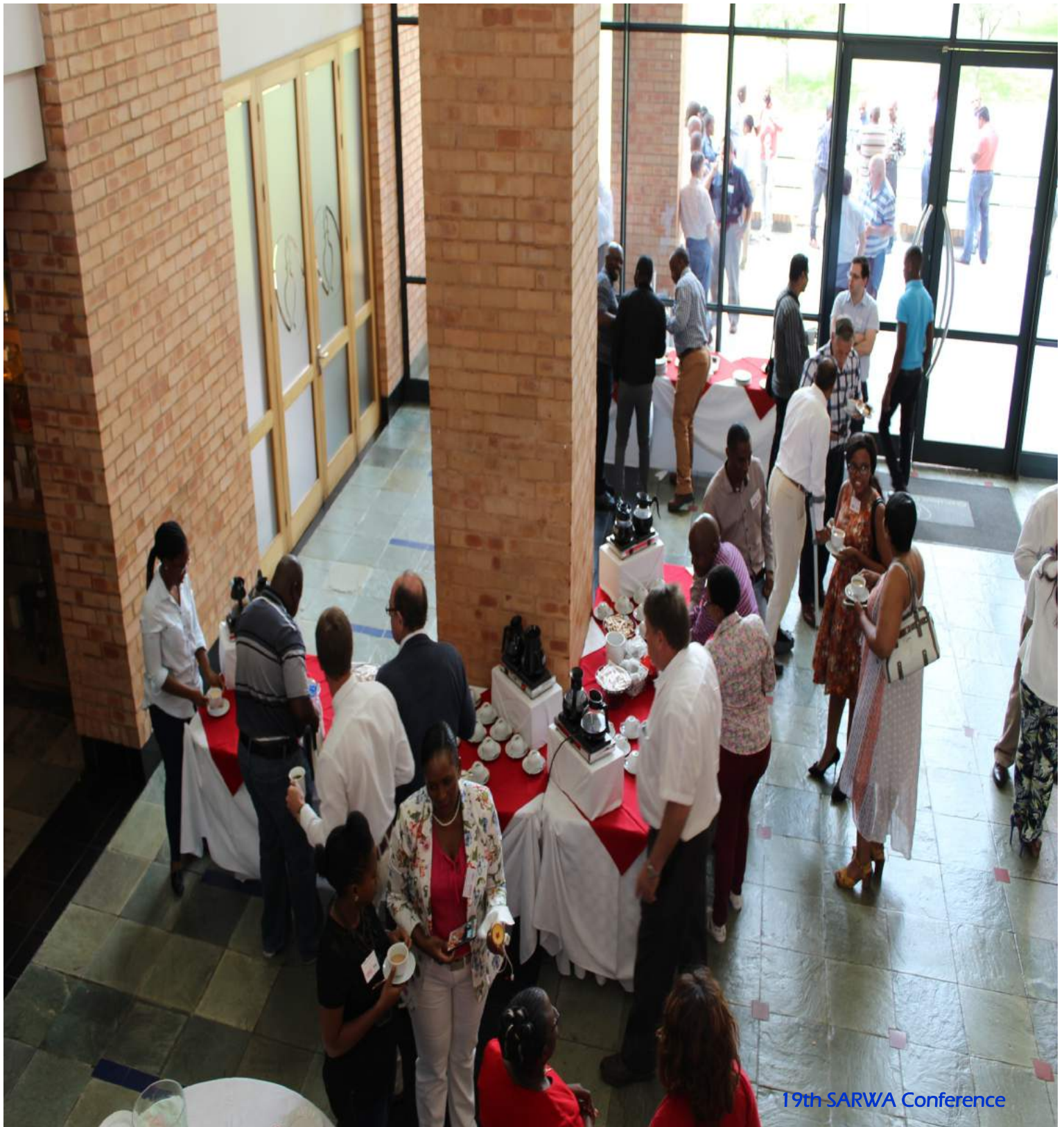
19th SARWA Conference